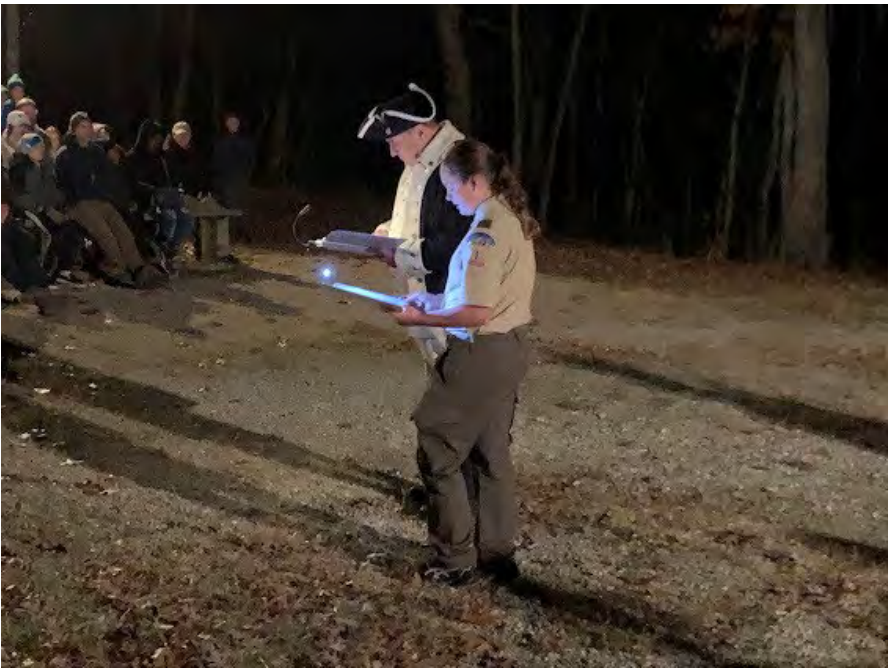
Figure 3A Scout participating in the role of Chaplain.