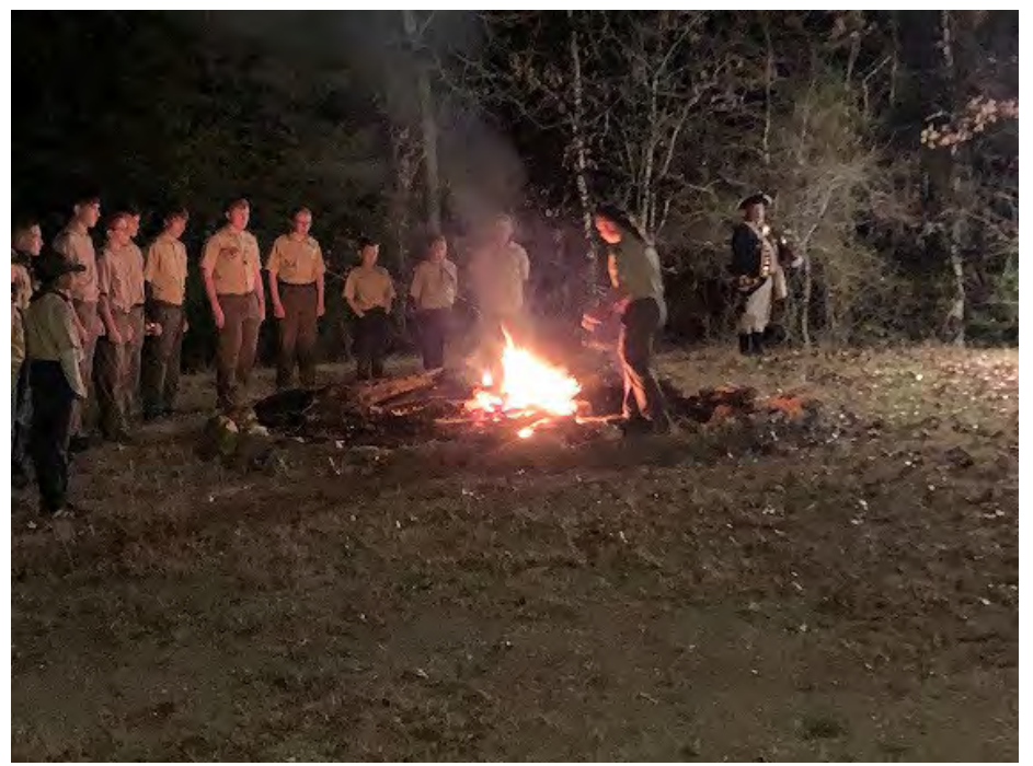
Figure 5 A Scout placing the blue star field in the fire.