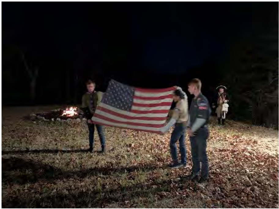
Figure 4 Senior Scouts display the flag to be retired.