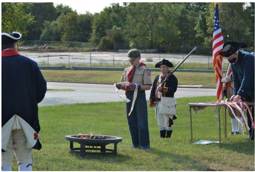
Figure 2 A Scout reads his stripe description before placing it in the fire.

The ceremony requires a flag that has been declared unserviceable and must be disposed of. Also, there should be some type of fire pit or campfire to place the pieces of the unserviceable flag in to burn completely. The flag to be retired or disposed of can be prepared ahead of the ceremony by separating the 13 stripes and the blue star field if time is limited. It is preferred however that the flag be cut apart as part of the ceremony and a piece given to each participant to present during the ceremony. If the flag has metal gromets then they should be removed prior to the ceremony. Each individual should be given a slip of paper with the description of the piece they are disposing of and what it represents. This is included in the script.