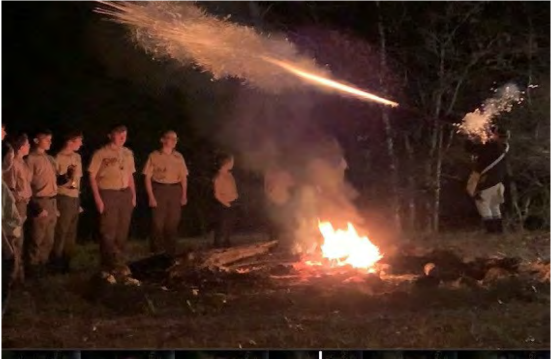
Figure 8 A Compatriot fires a musket salute.