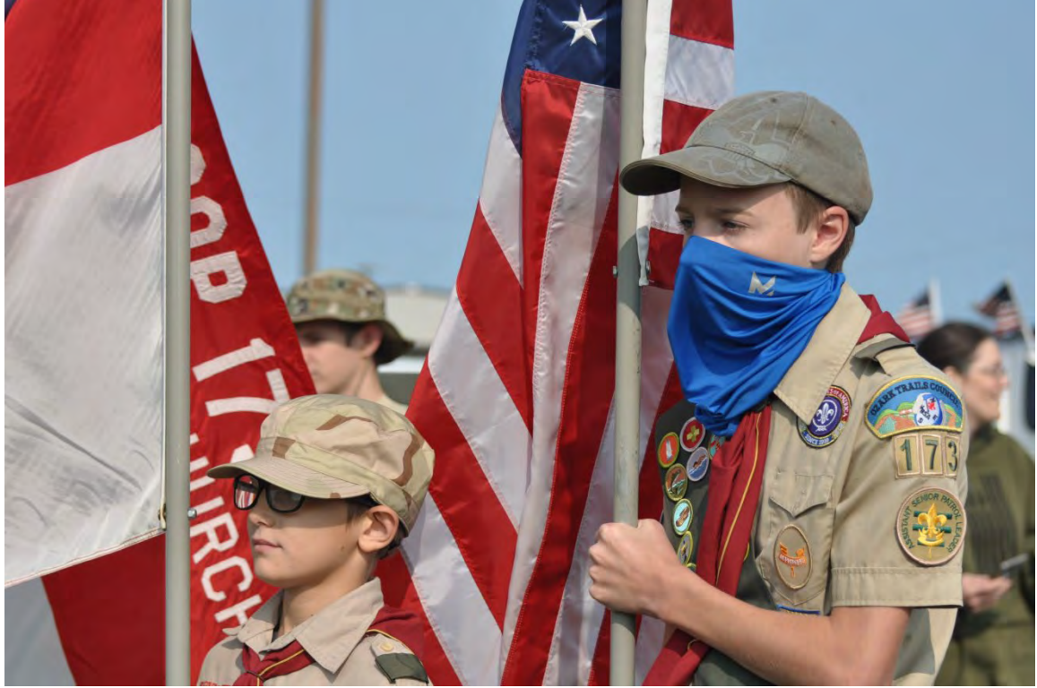
Scouts from Troop 173participate in opening ceremony.

The SAR 250<sup>th</sup> Anniversary Flag Retirement Ceremony is designed to be a tool that a chapter can use to conduct a patriotic and meaningful flag retirement ceremony with the Boy Scouts at camporees and campfire programs. It is a great tool for any gathering of Scouts who would like