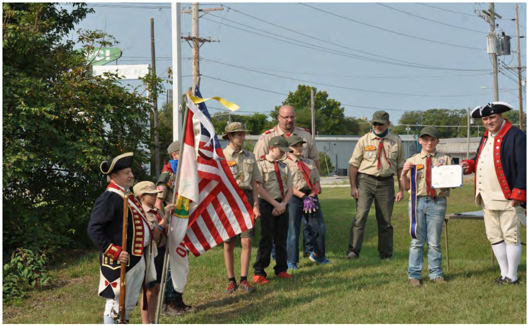
Figure 7 A Scout Troop receiving a Flag Certificate for proper display of the American Flag.