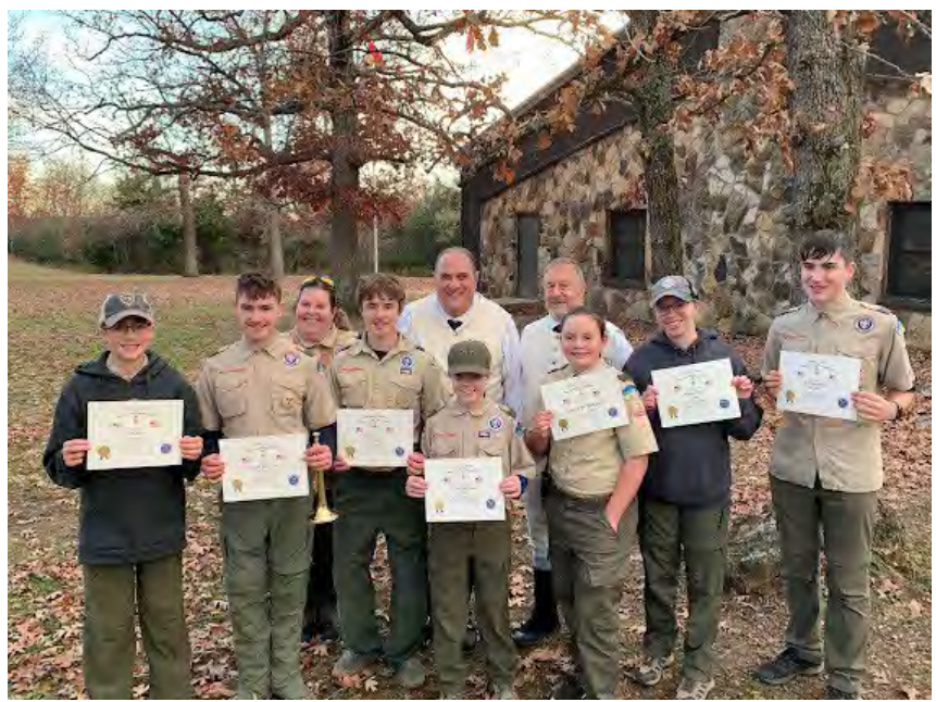
Figure 6 Scout Participants receiving their Flag Retirement Certificates.

This also gives the chapter the opportunity to present flag retirement certificates to any Scout who participates in the ceremony. A flag retirement certificate is a suitable and meaningful recognition of the individual's participation and a testament to their patriotism for them to proudly display. Flag Certificates can also be presented to any Scout unit present that displays their American Flag in a proper manner.