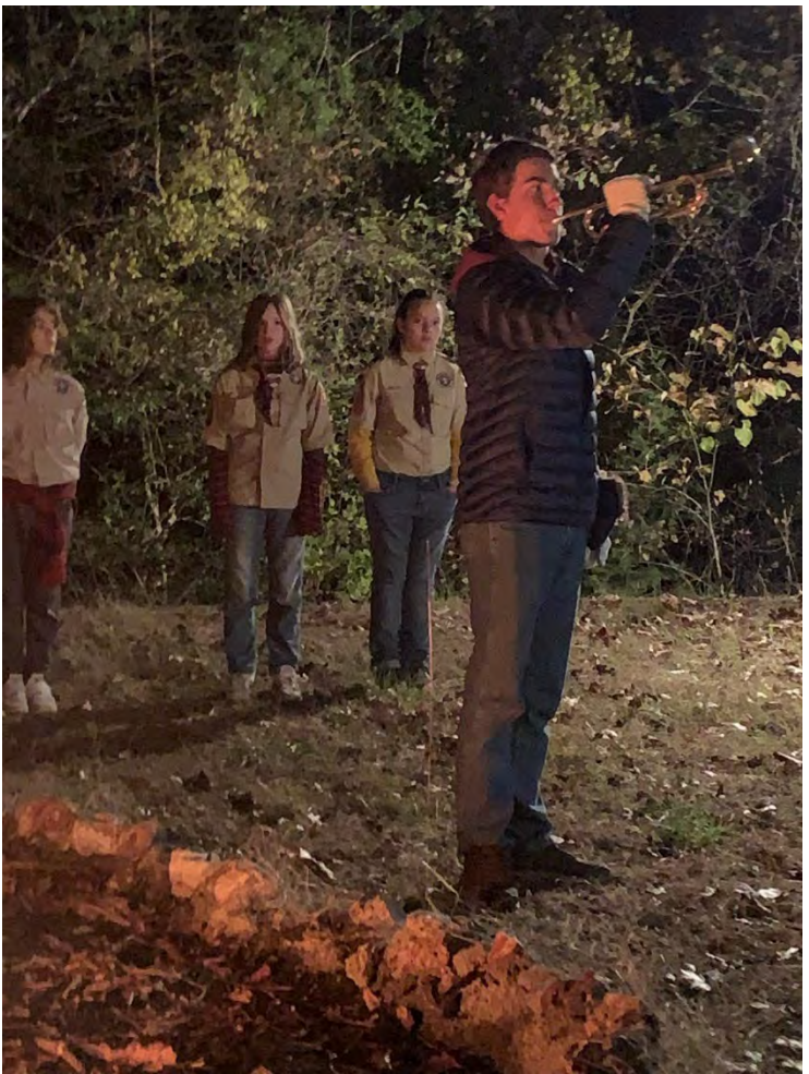
Figure 9 A Scout plays taps to end the ceremony.

Chapters can use this ceremony to reach out to Scout units to ask them to participate in this ceremony. It is a great way to build community awareness of our organization and promote patriotism and inform them of the upcoming 250<sup>th</sup> Anniversary.